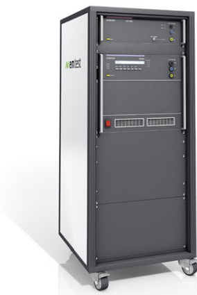
NetWave 7 integrated in a rack with DPA 500N