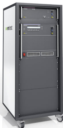
NetWave 7 integrated in a rack with DPA 500N