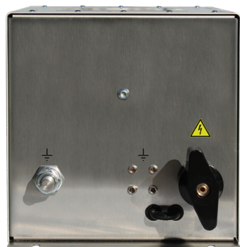
HV-AN 200, view to the AE port