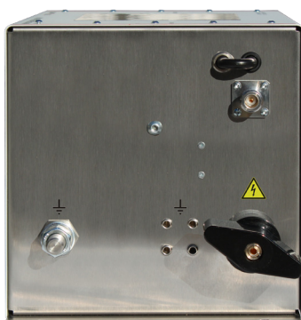
HV-AN 200, view to the EUT port