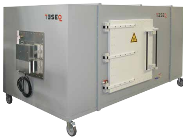
RVC XS with option EUT BOX-1 and 2x SIF RC