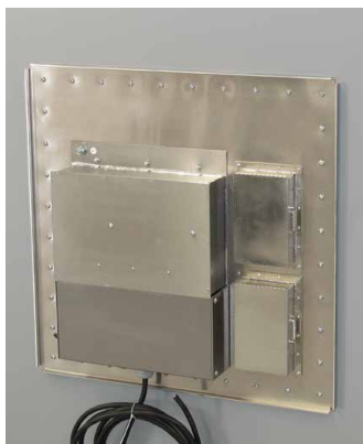
Option EUT BOX-1, DC1 and 2x SIF RC, view from outside