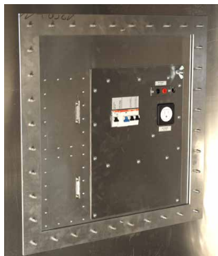
Option EUT BOX-1, DC1 and 2x SIF RC, view from inside

Teseq GmbH Landsberger Str. 255 · 12623 Berlin · Germany T +49 30 56 59 88 35 F +49 30 56 59 88 34 desales@teseq.com www.teseq.com