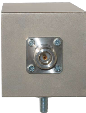
RSG 1000, view to the N connector