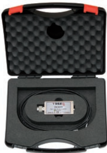
PMU 6003 in storage case