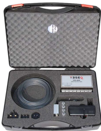
IOB 4000 in suitcase

The box consists of a robust metal case optimized for EMC. This is due to the intended use as interface box for monitoring signals for EMC measurements. The power supply is made using batteries in order to guarantee operation independent of mains power.