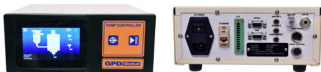
Figure 2: Front and Rear View of Programmable Controller

Pump Parameters available to the operator are acceleration, deceleration, speed, and in the case of dots, an exact amount of rotation. The touch screen interface is intuitive and is programmed for universal recognition with symbols and numbers. The programmable controller can also be connected to a computer for remote programming, making this a comprehensive controller for all Precision Auger pump needs. The operator may set up separate program profiles that can be referenced by inputs from your system. Figure 3 illustrates how an Auger pump integrates into a third party dispensing system.