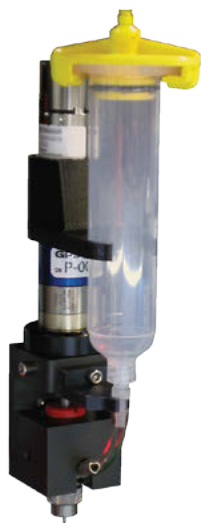
Precision Auger Pump

Upgrade your existing dispense robot with an advanced Precision Auger Pump. The Precision Auger Pump provides excellent dispense control and repeatability and is suitable for a wide range of applications and fluids.