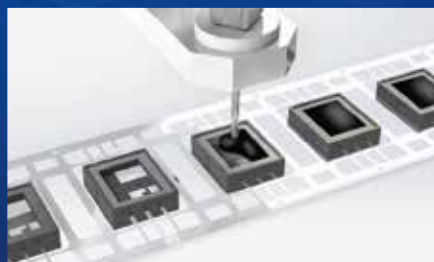
Potting sensor components