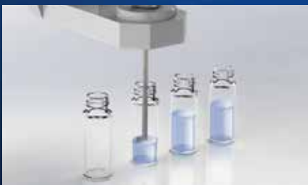
Dispensing into vial bottles