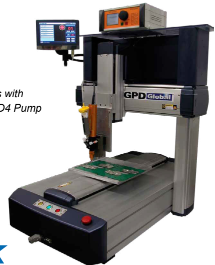
Island 3S4 Series with GPD Global® PCD4 Pump and Controller

The Island Series is designed to be an accurate, reliable platform for complex-to-simple dispensing tasks. Each system is built to last with its high quality materials and can be easily adapted to other applications or dispense pumps.