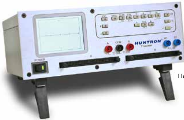
Huntron Tracker 3200S

The NEW Huntron® Tracker® 3200S is designed to encompass our product history and leadership in power-off test by providing powerful test and troubleshooting solutions.