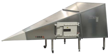
GTEM 750, door right side

A GTEM (Gigahertz Transverse Electro Magnetic) cell is a test site for efficiently performing both radiated immunity and emissions testing in a single, controllable and shielded environment. Compared to other test sites, GTEM testing is faster with high accuracy and excellent reproducibility.