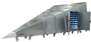
GTEM 1750, door right side, option EUT MG, option wheels

A GTEM (Gigahertz Transverse Electro Magnetic) cell is a test site for efficiently performing both radiated immunity and emissions testing in a single, controllable and shielded environment. Compared to other test sites, GTEM testing is faster with high accuracy and excellent reproducibility.