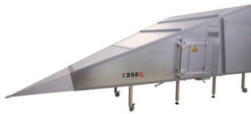
GTEM 1000, door right side

A GTEM (Gigahertz Transverse Electro Magnetic) cell is a test site for efficiently performing both radiated immunity and emissions testing in a single, controllable and shielded environment. Compared to other test sites, GTEM testing is faster with high accuracy and excellent reproducibility.