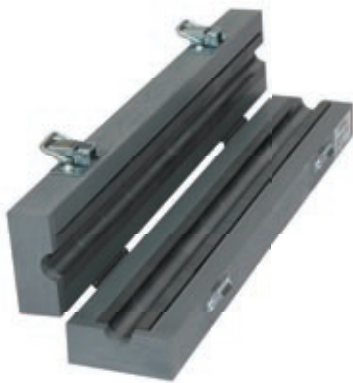
CMAD 10, side view