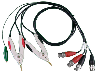
Kelvin Test Leads