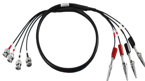
Alligator Clip Leads

Rack Mount Kit 2000-16 RS232-to-USB Adapter 630250