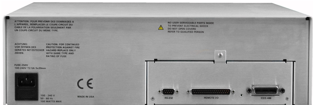
1900 Rear Connectors

Measurement results can vary substantially based solely on the source impedance of the test instrument being used. To compare measurements made on other test instruments, the 1900 series can have its source impedance set at 5, 25, 50 or 100 \Omega .