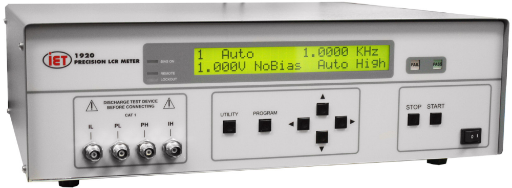
1900 Series Precision LCR Meter

The 1900 series consists of high-performance LCR Meters designed to perform fast, automated impedance measurements on a variety of electronic components and materials. These meters have a basic accuracy specification of 0.1% for accurate test results over a wide frequency range, from 20 Hz to 1 MHz. Besides their 15 impedance parameters, the 1900 meters are also capable of measuring dc resistance as well as monitoring the voltage or current in the device under test. The units incorporate a distinctive sequence test mode, allowing up to 6 uniquely different tests to be performed quickly on a single start command. Additionally, these meters include IEEE-488, RS-232, and handler interfaces, all standard.