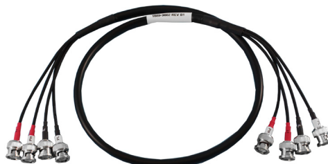
bnc-bnc Extender Cable, 1 m bnc-bnc Extender Cable, 2 m