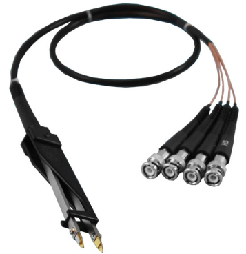
Chip Component Tweezers